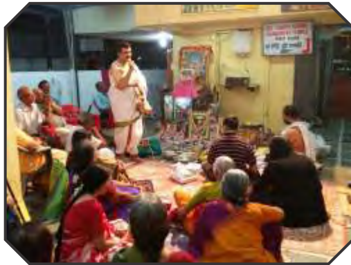
Aaradhana Abhishekam for Sri Seshadri Swamigal at Vashi Haveli