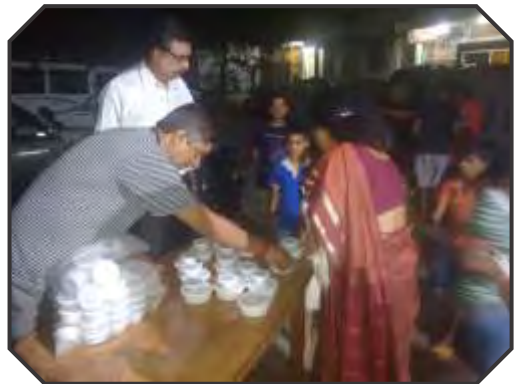
Annadanam at Mumbai Trust Office