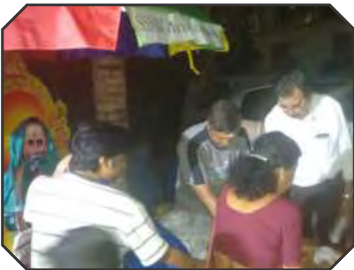
Annadanam at Mumbai Trust Office