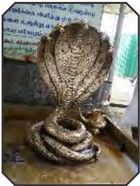
Nagarajar Abhisheka Pariharam at madambakkam