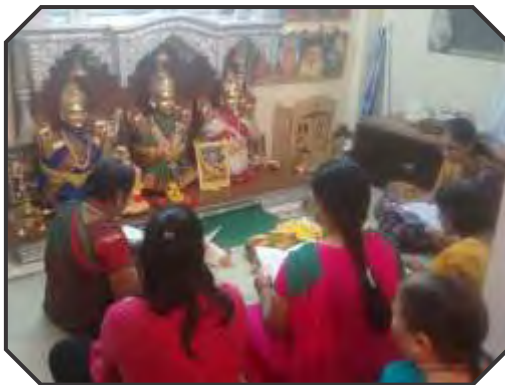
Hasta pooja at Mumbai Trust Office