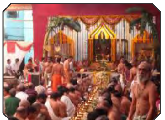
Ayyapa celebrations at vivek vidyalaya - Goregaon