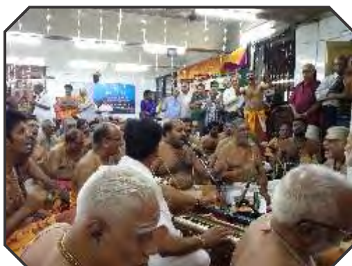
Ayyapa celebrations at Bhakta Samaj - Mulund