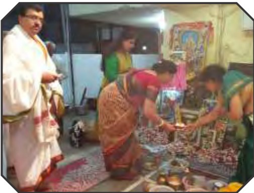
Aaradhana Abhishekam for Sri Seshadri Swamigal at Vashi Haveli