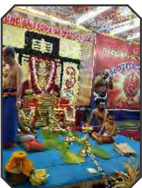
Ayyapa celebrations at Vani Vidyalaya- Mulund