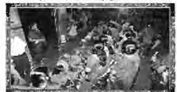
Suvasini Pooja in Gokuldham Hall 2010