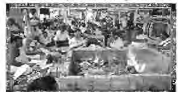
Sri Dattatreya & Sri Lakshmi Hayagravar Haven in 2013