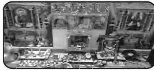
Kartik Purnima in Mumbai