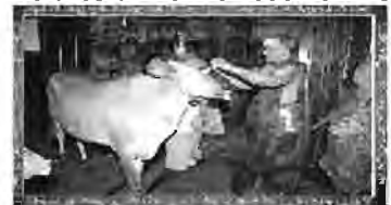
Gowmatha Pooja conducted during the Haven