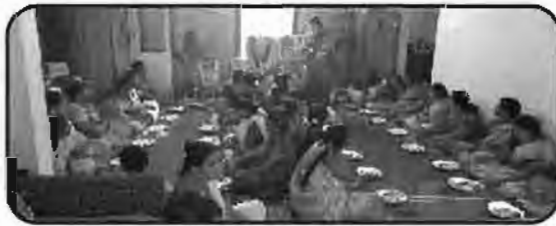
Bangalore - Hastha Puja

Lucky no: 3; Day: Thursday; Direction: North; Colour: Yellow; Deity: Rajakali amman on Sundays at Rahu Kalam; Siddhargal: Kanchamalai and Chennimalai on Fridays; Chandrashtama days: 8th-11th; you are asked to avoid taking important decisions on that day.